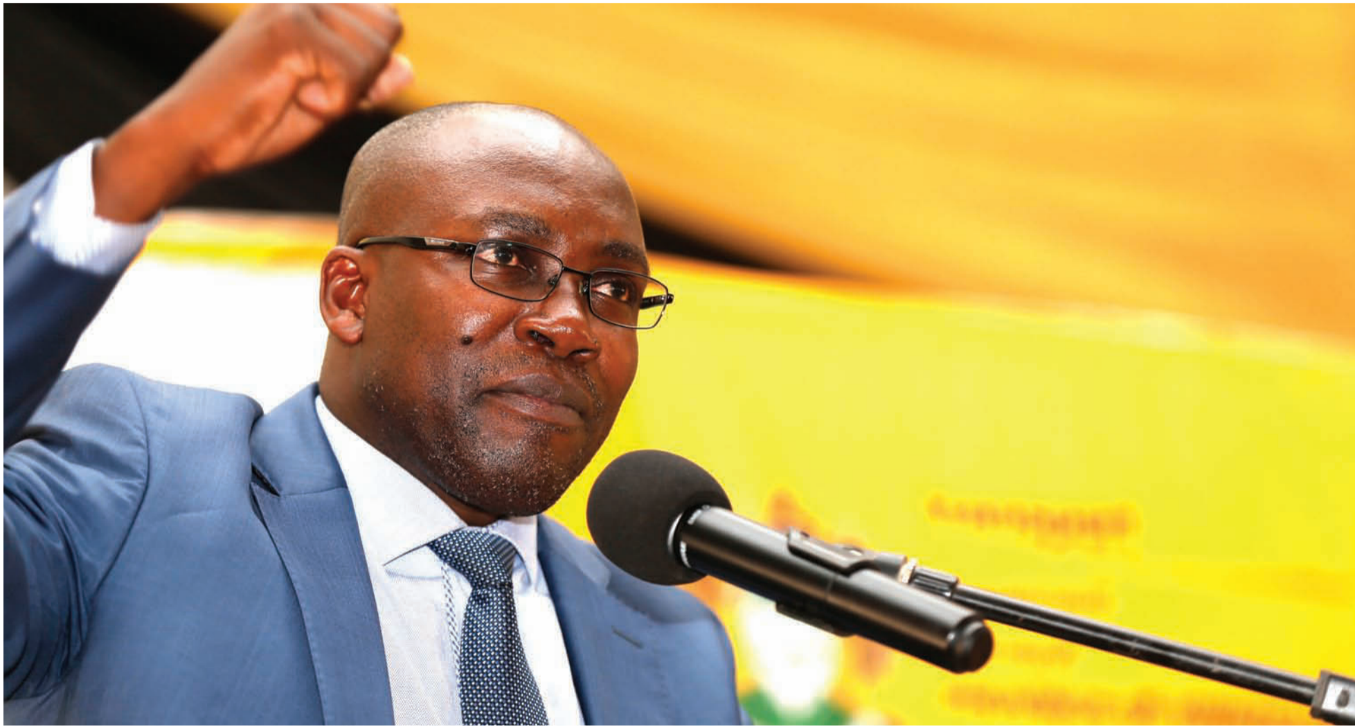
Transport, Community Safety and Liaison MEC Mxolisi Kaunda has announced a R9.96 billion budget to drive radical socio-economic transformation and expand roads and transportation infrastructure and services to KwaZulu-Natal citizens equitably. THAMI MKHULISA

The Department will establish a dedicated Youth Directorate to drive youth economic empowerment programmes in the transport sectors in the province.