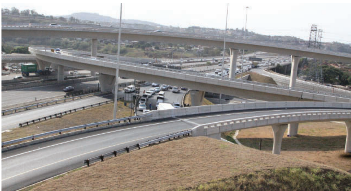
Some major road infrastructure investments in KwaZulu-Natal include the Umngeni Interchange in Durban.

What excites us more about these road projects is that they create job opportunities for local people and also assist with skills development and transfer.