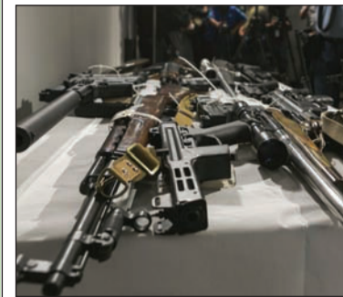
Some of the illegal firearms that were seized during the police campaign in KwaZulu-Natal.