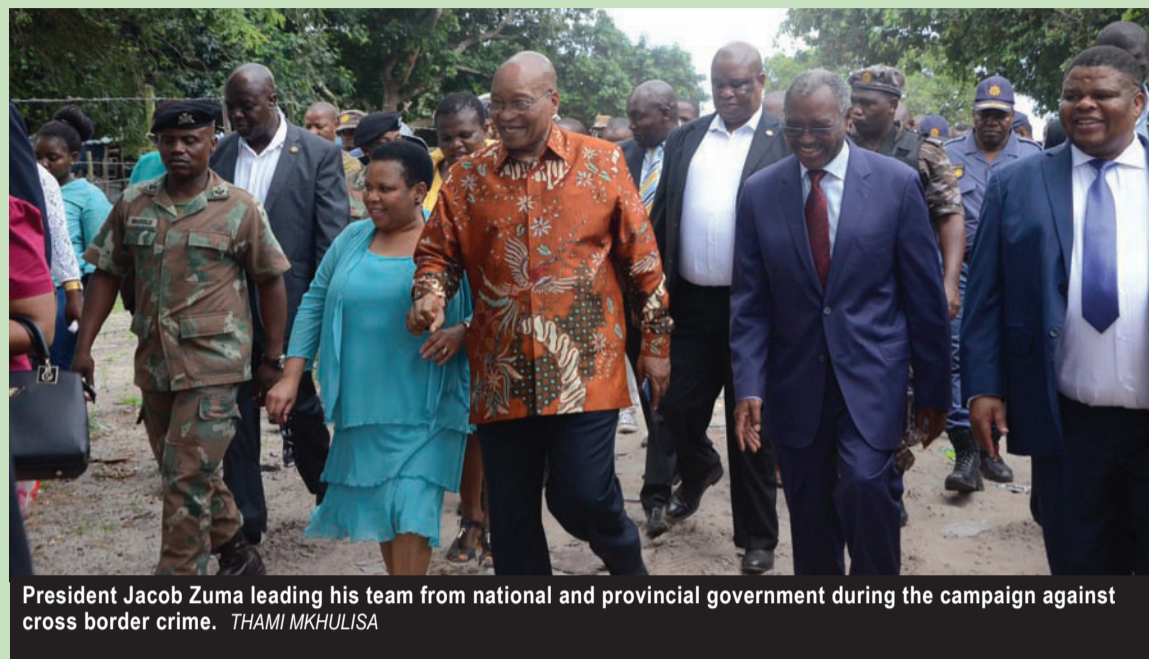
President Jacob Zuma leading his team from national and provincial government during the campaign against cross border crime.